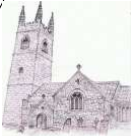
St Winwaloe, Poundstock