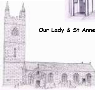
St Mary the Virgin, Week St Mary