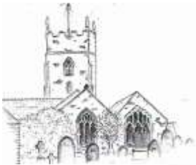
St Marwenne, Marhamchurch