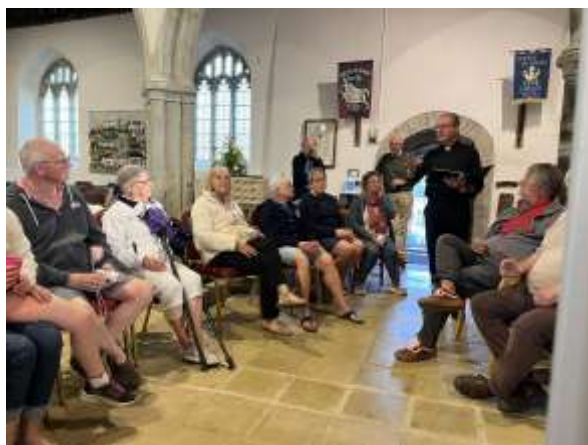
VE day group in church