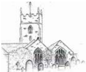
St Marwenne, Marhamchurch