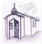
Our Lady & St Anne, Widemouth Bay