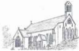
St Michael & All Angels, Bude